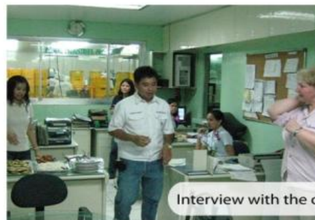
Interview with the company managers